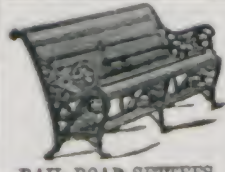
RAIL ROAD SETTEES.